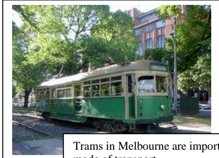
Trams in Melbourne are important intra-city mode of transport