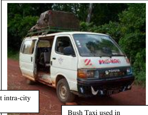
Bush Taxi used in developing countries