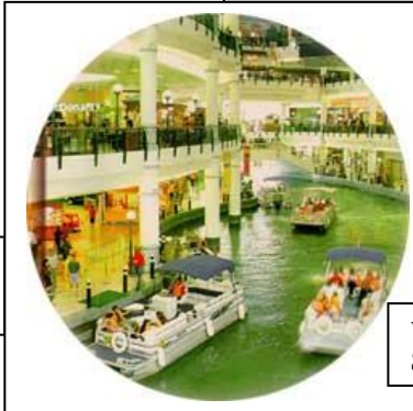
Water taxi at Mines Shopping Centre